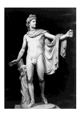
Figure 1 Roman, Apollo Belvedere , c. 2<sup>nd</sup> century AD. Marble, H 224. Rome: Vatican Museums.

The plaster mould is of course the most bespoke container, recording, as it does, the exact form (three-dimensional outline) of that from which it is made. Winckelmann's image goes farther, however, as it also references the material characteristics of gypsum plaster. Resulting from processes of burning, milling and sifting, purging and purification, gypsum plaster is a material free from any value or meaning of its own. To follow Winckelmann's comparison, it is open to reflect only the beauty of that which it reproduces.