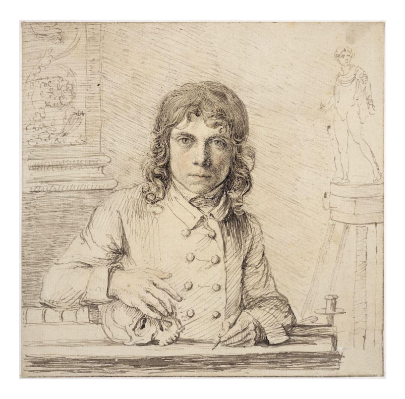
Figure 2 John Flaxman, A Self-Portrait at the Age of 24, 1779. Pen and ink, with pale pink tinting on face and hands, 18.7 x 18.1. London: UCL Art Museum, University College London, inv. no. 616.

The standard of good taste upon which in this comparison the feeling for the beautiful is cast/modelled, namely 'the Apollo', is of course primarily the Apollo del Belvedere (fig. 1), but by dropping the epithet, Winckelmann implicitly also references the ancient god of the arts himself. A similar if considerably less physically charged conflation can be seen in John Flaxman's early self-portrait of 1779, where a reduced copy of the Apollo del Belvedere appears as both sculptural model and inspiring visualization of the god (fig. 2).