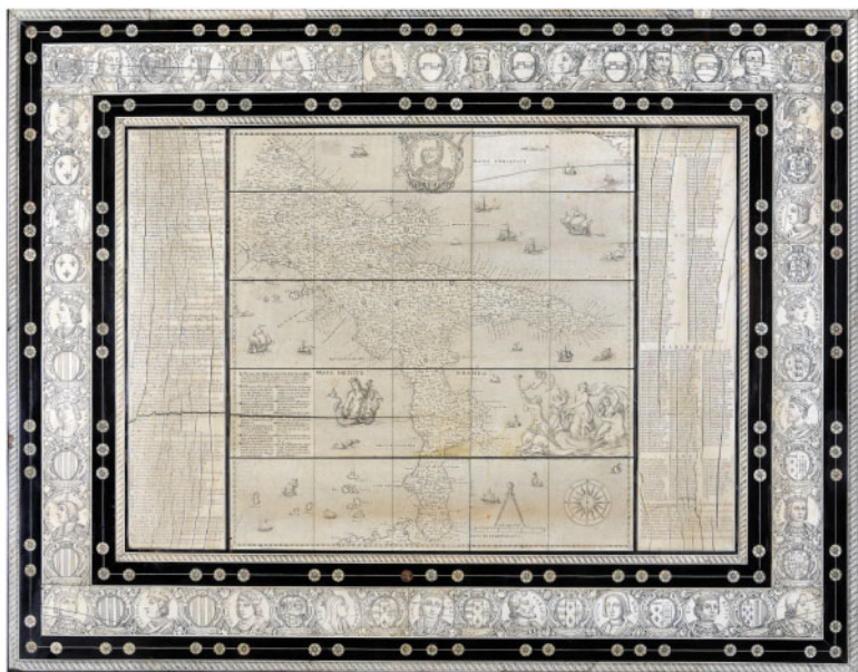
1. Interior side of an inlaid cabinet dating to 1619 showing the Adriatic Sea surrounded by cameos of kings of Spain and Naples; the external face shows a map of the globe. The cabinet, produced in the circles of the Viceroy of Naples, was part of a series and is now held at the Certosa e Museo di San Martino.

Diplomatic dispatches and petitions show that Ottoman authorities and merchants kept a close eye on the events. In the months before the battle they demanded redress from the Venetians for the losses incurred as a result of earlier Spanish attacks. The sultan sent an envoy to Venice, which he held responsible for failing to protect the Adriatic. 102 After the battle, diplomatic dispatches show that the Ragusan and Venetian envoys engaged in fierce discussions in Istanbul. The former, subjects of the sultan, complained of