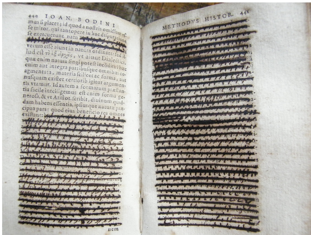
Figure 1 (above). Idiosyncratic expurgation of Methodus (ed. Heidelberg, 1591). Biblioteca della Fondazione Firpo, Turin, shelfmark FIRPO.2370.